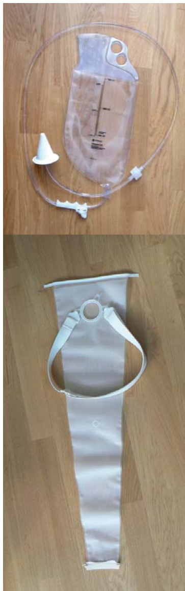
Hollister Incorporated irrigation bag (top) and sleeve.

The minimum kit you'll need is an irrigation bag (with attached tubing and cone tip), irrigation sleeve, an ostomy belt and a clip. Depending on what